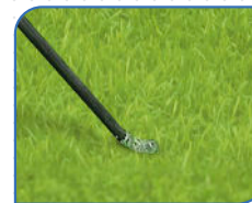
Hole for Nail Grouting