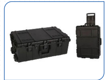
Plastic Injection Moulding