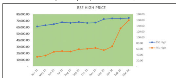
Share Price Performance of Precision Electronics Limited (PEL) in comparison with BSE Sensex for the period April 1, 2023 to March 31, 2024